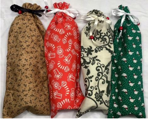
Bags for Wine or other Gifts