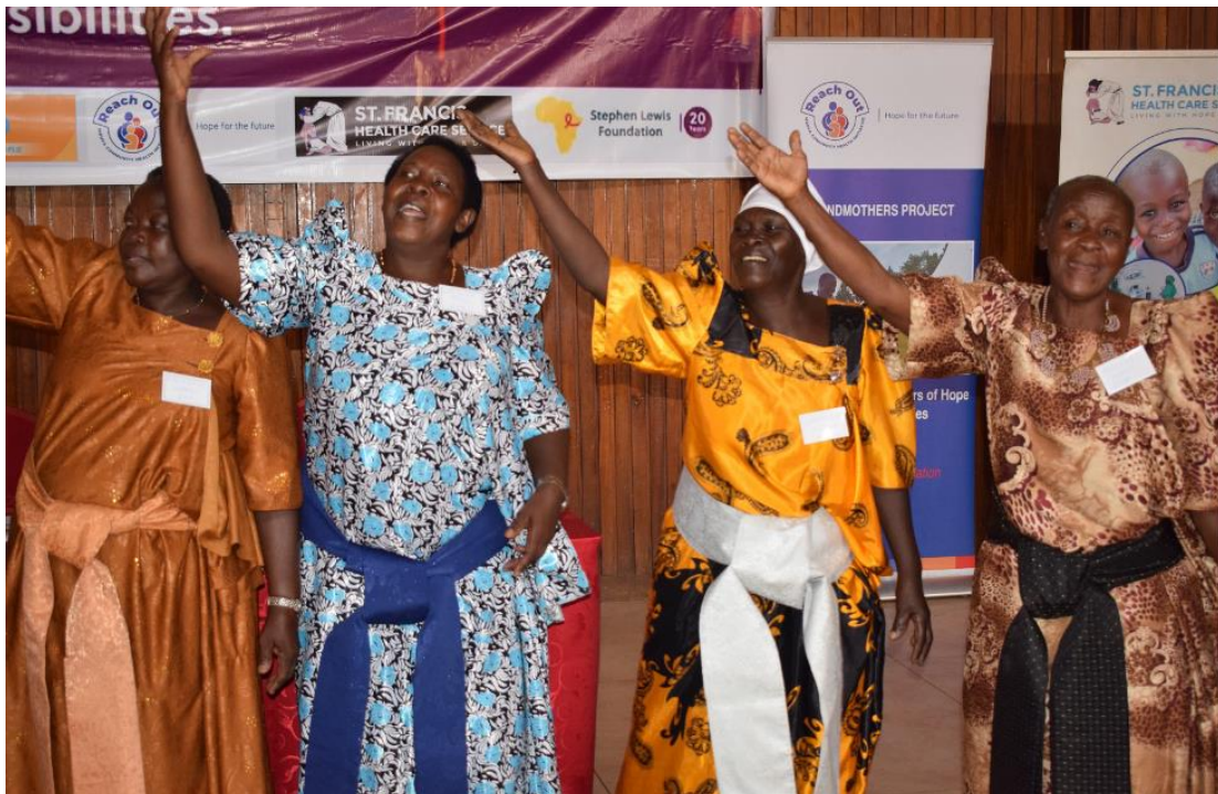
Delegates from Uganda above and Tanzania below